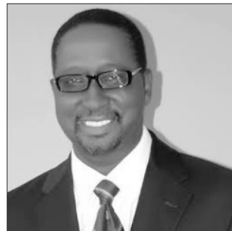
HON. (BARR) ADEBOWALE OJURI